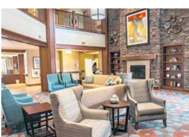
Baby boomers' expectations go beyond rocking-chair stereotypes, says an executive with Sage's management group.

Above, the center courtyard at Sage Assisted Living, 2365 W. Orange Grove Road, features a putting green.